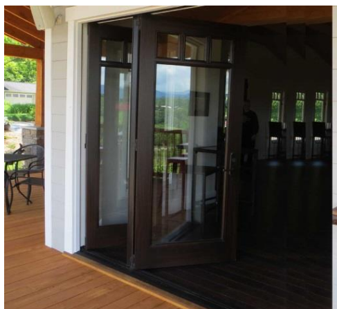
A 3 Panel Bi-folding unit with Ebony finish opens this winery tasting room to the fresh air patio.

Our Flat Track barn door hardware is very popular and comes in a range of styles and finishes. It works great for a variety of indoor or outdoor applications.