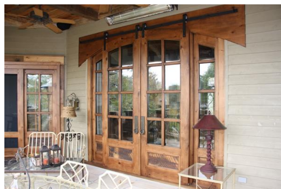
Exterior, Double doors on barn style, flat track sliding hardware.

Our "Lift and Slide" systems are made of nylon rollers and stainless steel which prevent corrosion and insure smooth operation. They will accommodate large doors up to 14 feet tall, 10 feet wide and 880 lbs. per panel. It is covered by a 15 year warranty on hardware.